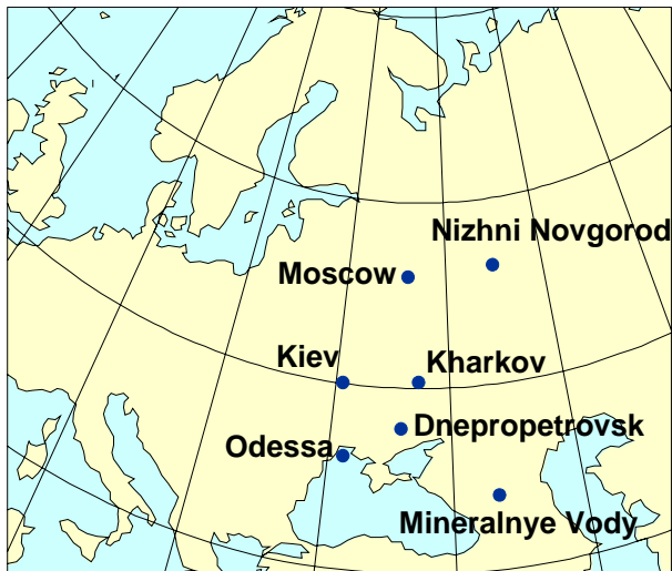
Fig. 1. Locations of the airports in European Russia and Ukraine, for which the FP conditions are studied in the paper.

December). At the other airports, FP monthly mean maxima are 1.13 (Sheremetyevo, January), 1.03 (Domodedovo, December), 1.29 (Vnukovo, January), 0.44 (Nizhni Novgorod, November), 1.35 (Kiev, December), 1.10% (Odessa). For Kharkov and Dnepropetrovsk, the maximum monthly mean occurrence frequencies derived from the available data are about 1.0% (November to January) and 1.45% (December), respectively.