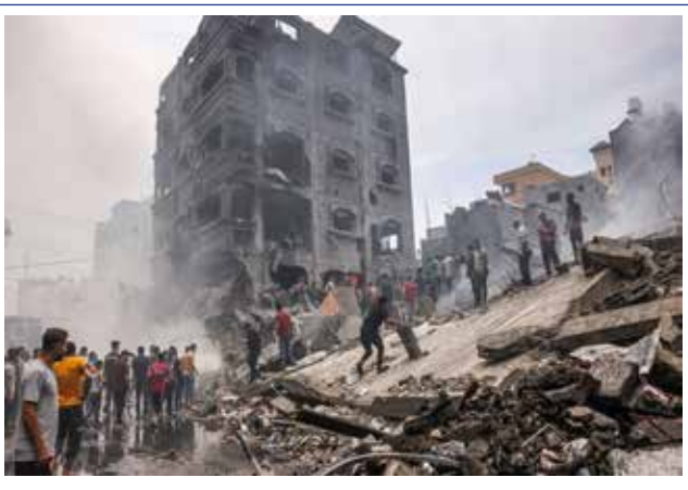
Figure 2. The face of Israel-Hamas war (Gaza, 2023)

This conflict has seen escalations in violence, causing devastating consequences for both sides. The exchange of rocket fire, airstrikes, and ground operations has resulted in loss of lives, infrastructure damage, and deepened the humanitarian crisis in Gaza. This conflict has wider implications, potentially involving other actors and destabilizing the Middle East. It is crucial to continue efforts to reach a lasting and peaceful resolution. International actors can help facilitate dialogue, promote de-escalation, and address underlying grievances. A comprehensive approach is needed to mitigate the risks of instability posed by this conflict.